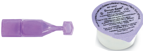
1 & 2 mL vials

The Sweet-Ease 24% sucrose and purified water solution is used to soothe the baby.