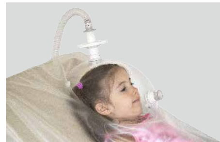
Canopy Hood (small or large size) utilizes a single-use veil to avoid cross contamination

Face Mask Mode. REE measurements can be performed using an oronasal face mask on spontaneously breathing subjects whenever Canopy Hood cannot be used (special subjects, claustrophobic, etc.). The face mask (available in 5 sizes) is placed on the subject and fixed with a comfortable headcap. A turbine flowmeter is connected to the face mask to measure ventilatory parameters and a sampling line is used for the measurement of inspiratory and expiratory O_2/CO_2 concentration.