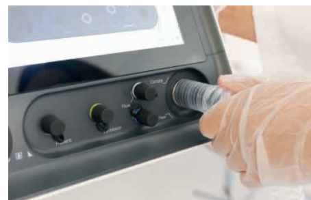
Canopy tests require a simple set-up by connecting the canopy hose to the blower