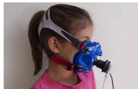
Multi-use silicone oronasal face masks are available in 5 different sizes (adult and pediatric)